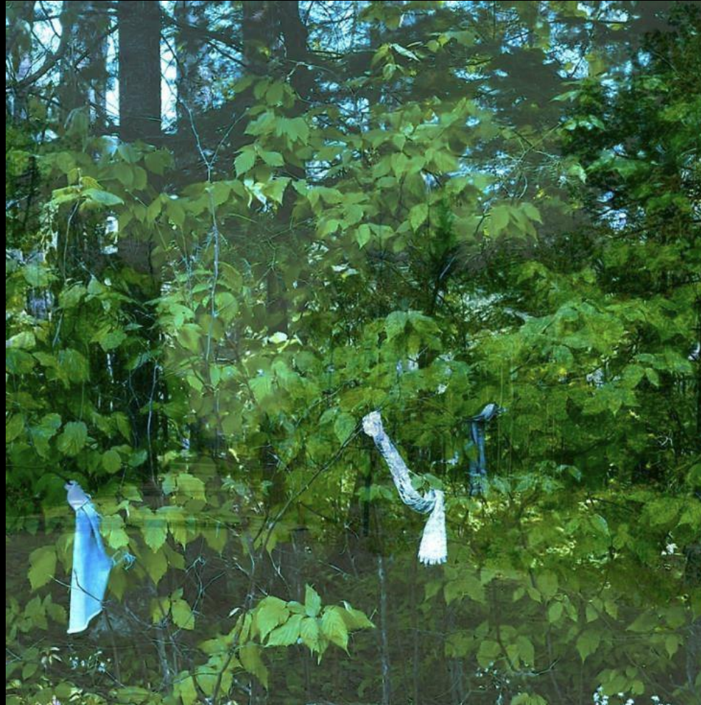
PRAYERS TIED INTO THE TREES AT THE PROTEST SITE