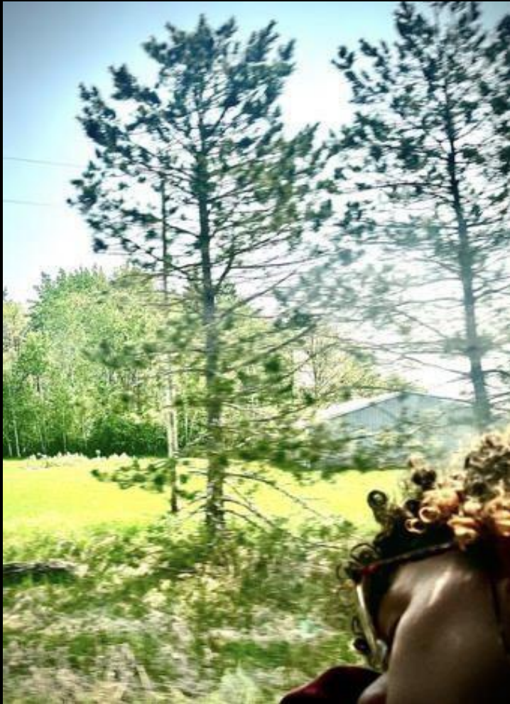
ON THE BUS TO THE WATER PROTECTORS CENTER