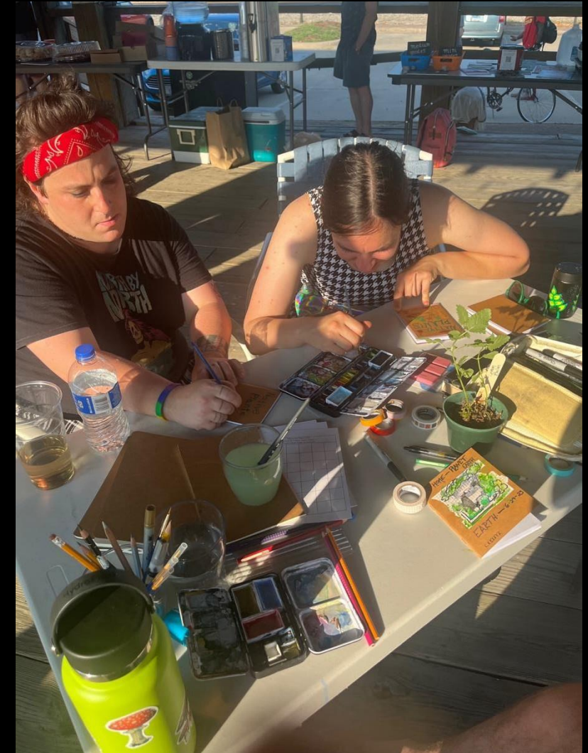
GROWING NOTES : A COMMUNITY ART EVENT MAPPING AND JOURNALING ABOUT NATIVE PLANTS WITH LOCAL COMMUNITY ORGANIZATIONS IN CARBONDALE IL