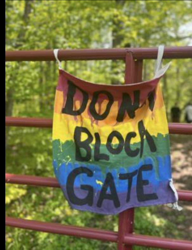
THE GATE TO THE WATER PROTECTORS CENTER